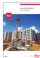
Leica Nova MS60