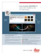
Leica Cyclone REGISTER