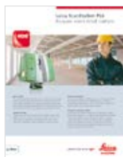
Leica ScanStation P16

Illustrations, descriptions and technical specifications are not binding. All rights reserved. Printed in Switzerland – Copyright Leica Geosystems AG, Heerbrugg, Switzerland 2016. 832259en-us – 04.16